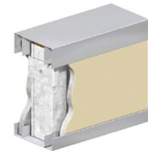
Solid vertical section