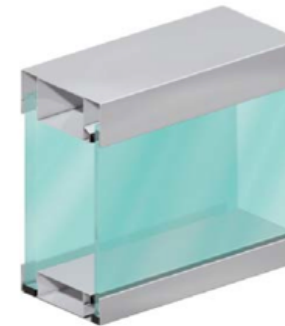
Double glazed vertical section