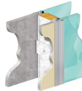
Double glazed to solid mullion